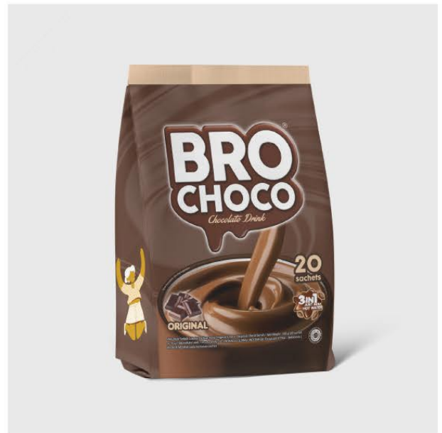
Original - P20