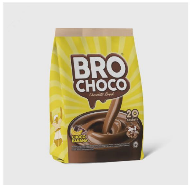
Choco Banana - P20